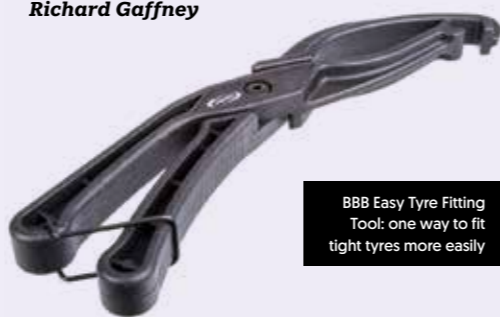
BBB Easy Tyre Fitting Tool: one way to fit tight tyres more easily