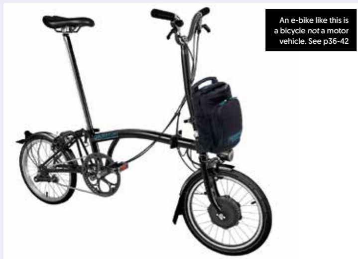
An e-bike like this is a bicycle not a motor vehicle. See p36-42

Questions answered, subjects explained – Cyclopedia is your bimonthly cycling reference guide