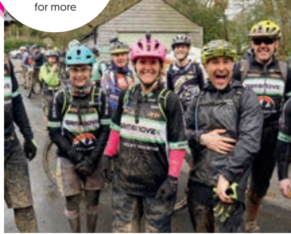
part in the Devon Dirt Below: Much of it is on green – well, brown – lanes Bottom: Finishers get a medal

Get off-road Cycling UK has lots of advice on riding off-road. Visit cyclinguk.org/mtb for more