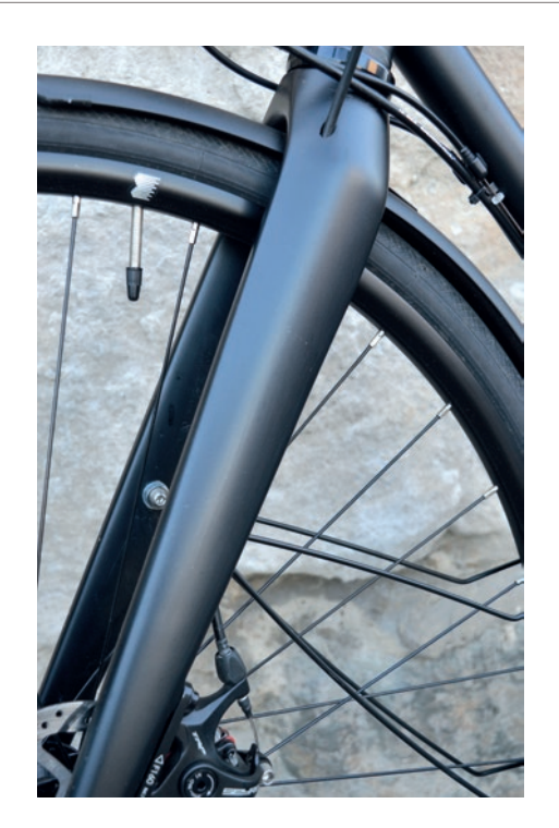
discs, and they're positioned to avoid a rack and mudguards