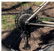
Above: Bottom gear is 17in. In conjunction with the traction benefits of wide, soft tyres, it climbs steep slopes really well

T he Beyond+ is a bike in the same mould as the Surly Krampus reviewed last issue: a rigid steel mountain bike with plus tyres that's extensively barnacled with mounts for bags, racks, bottles and mudguards. These wheels are the smaller plus size: 27.5x2.8in. It will take 29x3in wheels as well; Bombtrack's 29x3 Beyond+ ADV uses the same frame.