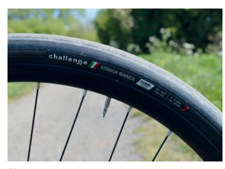
Above: The tyres are nominally 33mm but stretch to 39mm wide on these 19mm-internal rims

The Ramble is a kilo lighter than the CdF 10, largely because its chrome-moly frame is equipped with a carbon-and-aluminium fork rather than a steel one. At 11kg, it still feels relatively heavy, falling midway between an