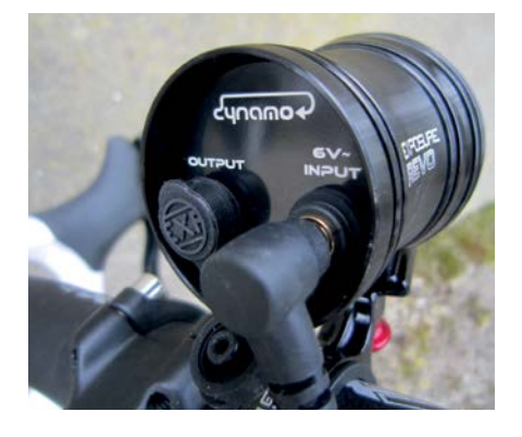
Above: No on-off switch means daytime running lights – unless you unplug the input cable

Crisply machined from aluminium billet and finished to Exposure Lights' usual immaculate standard, the Revo is nuggety, with external dimensions suggestive of a small battery light. It's reasonably light at 110g, including the handlebar mounting bracket. This neat component's hinged aluminium cradle clamps the handlebar centre bulge via a small M5 screw, and is supplied with adaptor sleeves to convert either from 35mm to 31.8mm or 31.8mm to 26mm depending on the bracket provided. The light clips to the bracket using a wedge-shaped cleat secured by a spring-loaded conical pin; both fitting and removal are quick and easy, and the system is both hard to get wrong and completely reliable if done correctly.