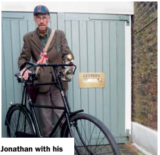
28in Royal Enfield

Attached is a photo of me ready for this year's Tweed Run in May. The CTC badge on my cap is my