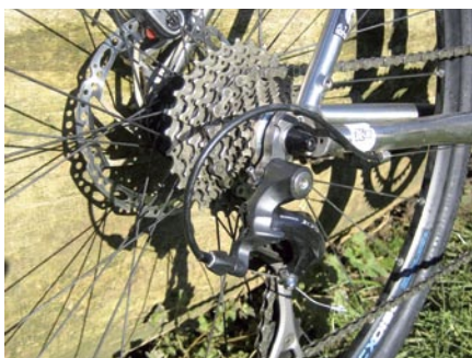
● Road bike derailleurs, cassette and chainset restrict gearing choices. I wanted off-road ratios ●

At the front, my size 42 SPD winter boots