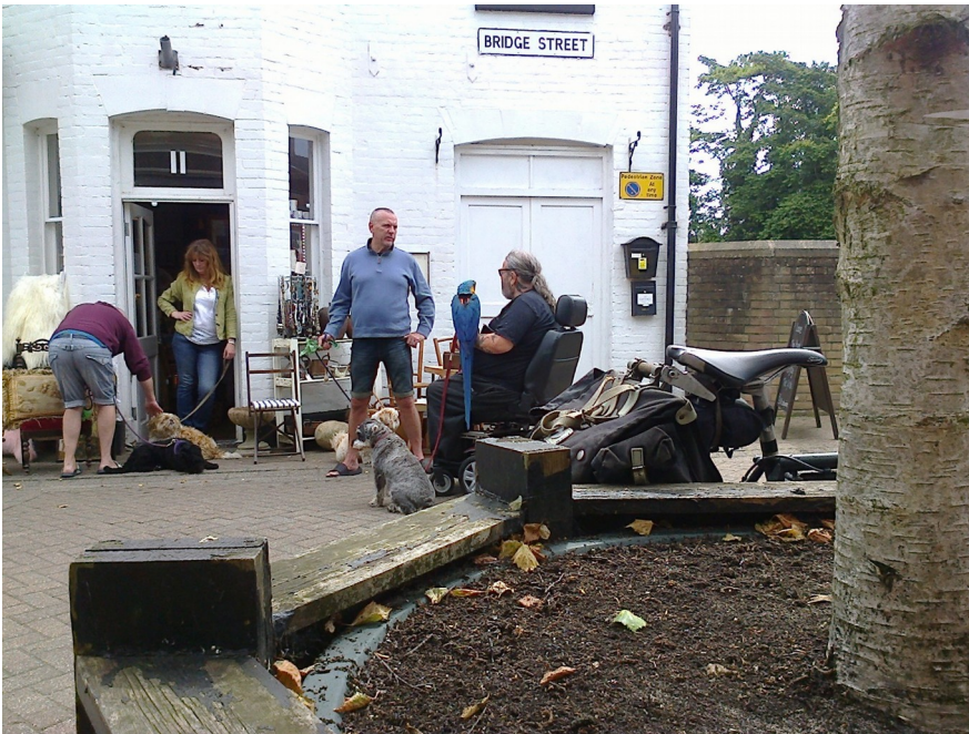
Man with Macaw (Halesworth)