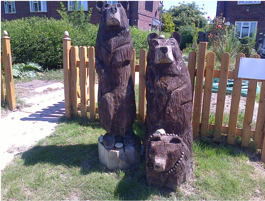
The Three Bears (Thurne)