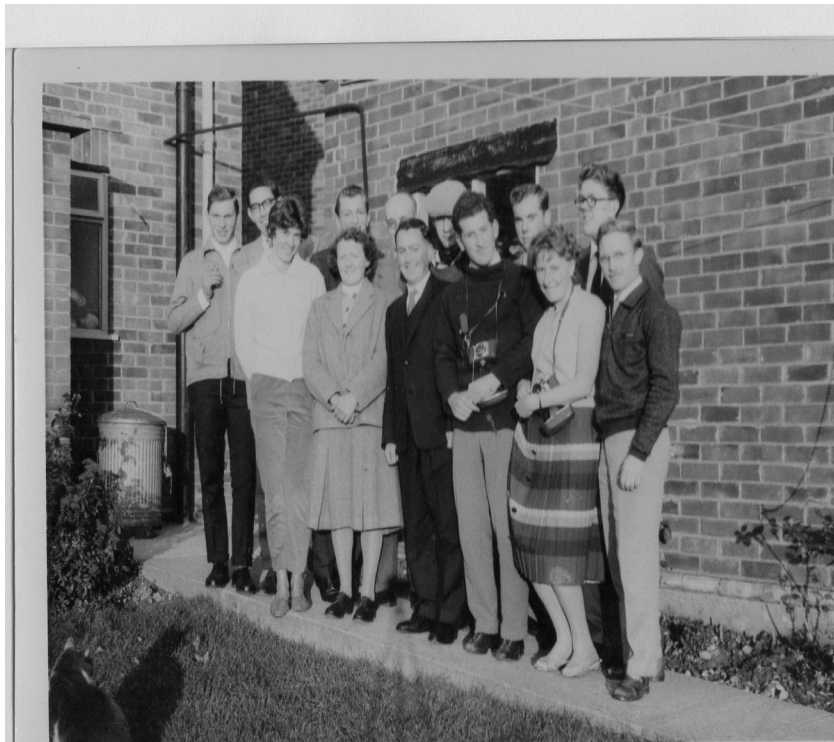
Members at the first AGM in 1961

Now we come to the answer to the original question, an open 25 mile Time Trial and four Ipswich & District Cycling Association evening events in July. A celebration lunch in the autumn will mark this milestone in an uncertain racing year.