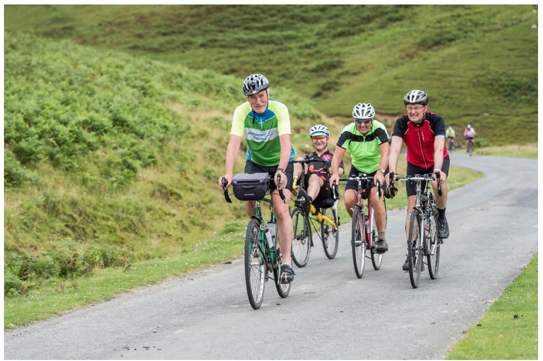
A great example of the rule of thirds which also shows people having fun.

The benefit of technology, you have endless opportunity to get that perfect shot. Take more photos, you can always delete them if they're not up to scratch.