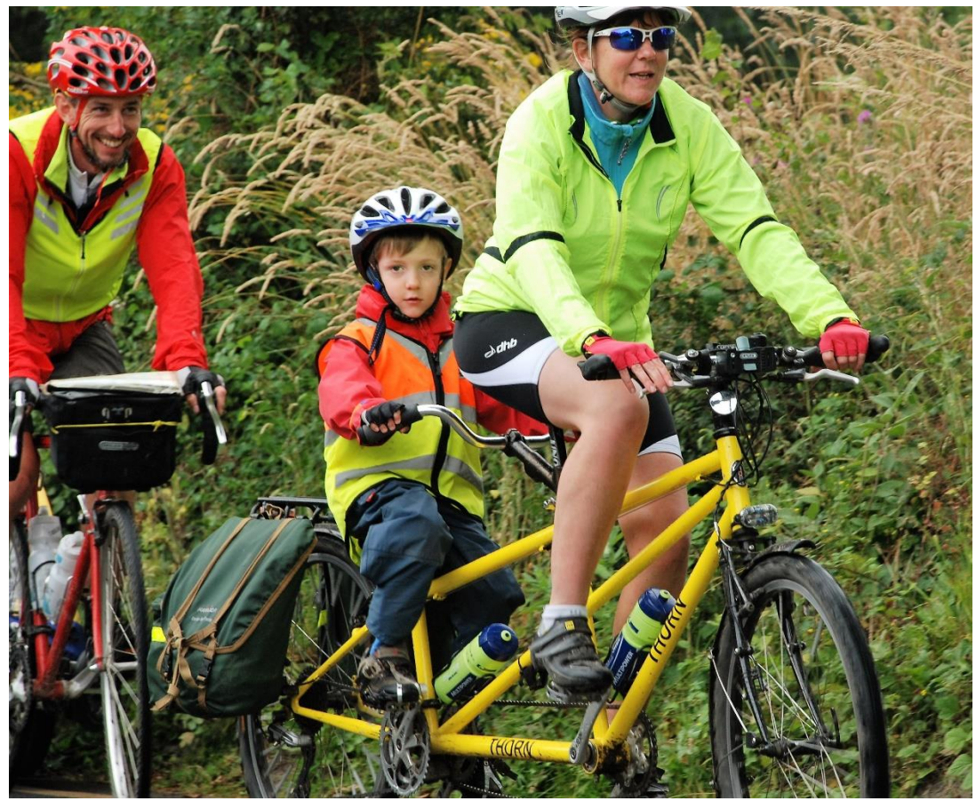
A diverse group with a good focal point, the frame is well filled and there's no excess space.

Send us photos of your ride using the hashtag #CyclingUKGroups on Facebook, Instagram or Twitter after following this toolkit and get featured in CycleClips if they're up to scratch!